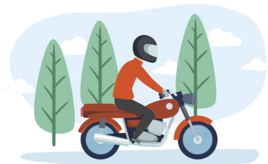
All boxC employees to use their personal vehicles

We are ready for a post COVID world. With elaborate SOPs & robust checks in place to ensure that all our products & services are delivered with utmost safety & hygiene, your health is our number one priority.