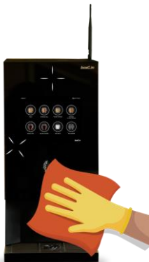
Hourly machine Sanitization using Acton™